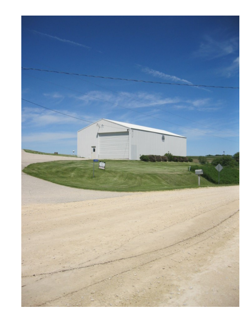
Warehouse 32' x 72' with 20'x 15' overhead door