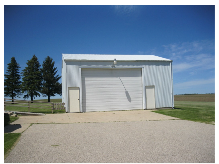
Garage 24' x 32' with shop & large double door

Information herein is believed to be accurate, but is not warranted. We assume no liability for errors.