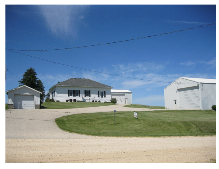
Garage 14' x 24' (on left)