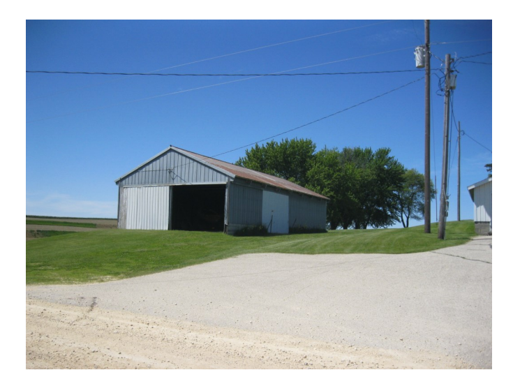
Machine shed 30' x 60'