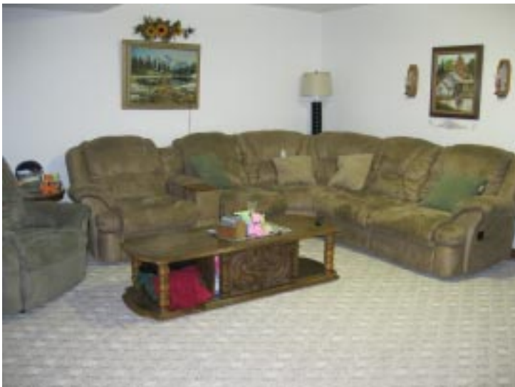
Basement Family room