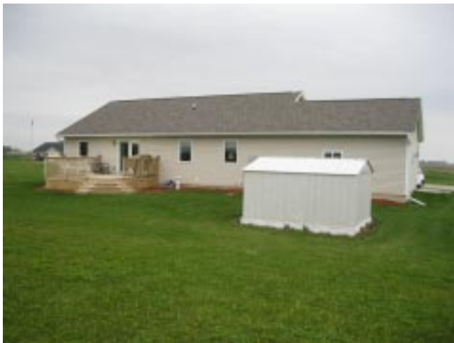
Back yard view