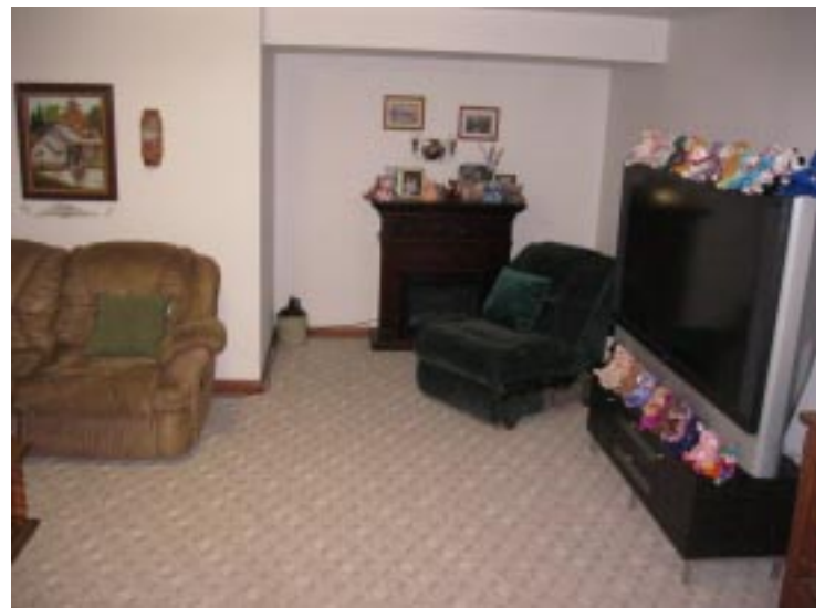
Basement Family Room