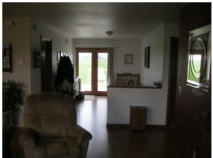
Foyer leading to deck