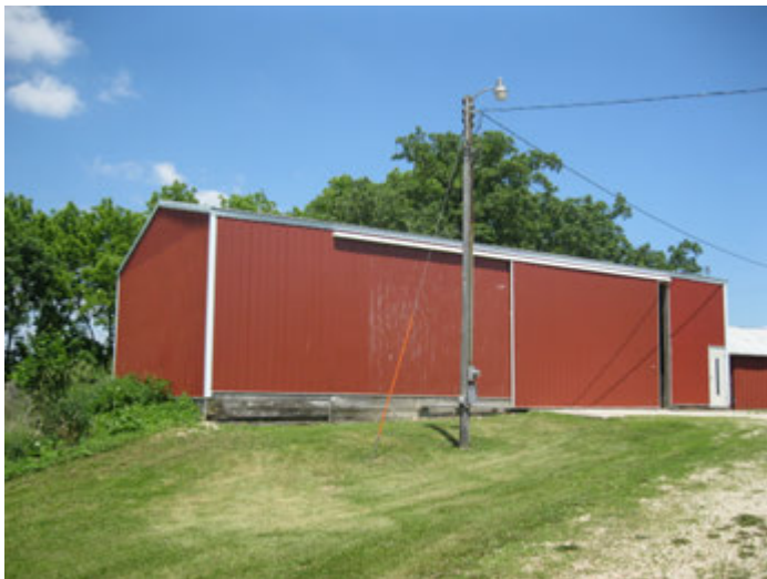
36' x 60' pole building with concrete floor