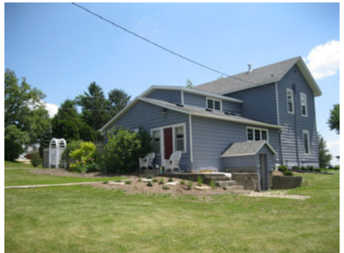
Rear View of home