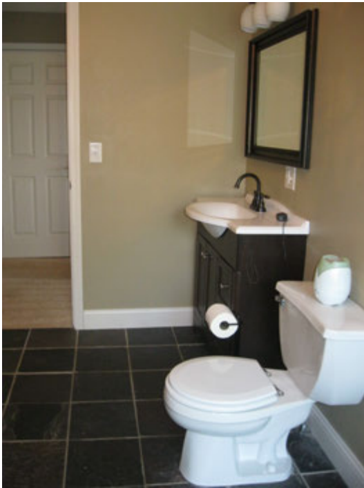
2nd Floor Bathroom