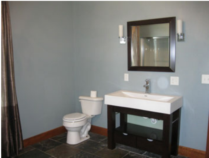
Main Floor Bathroom