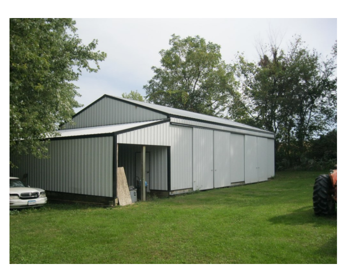
Machine Shed 30' x 50' with 12' x 30' lean-to