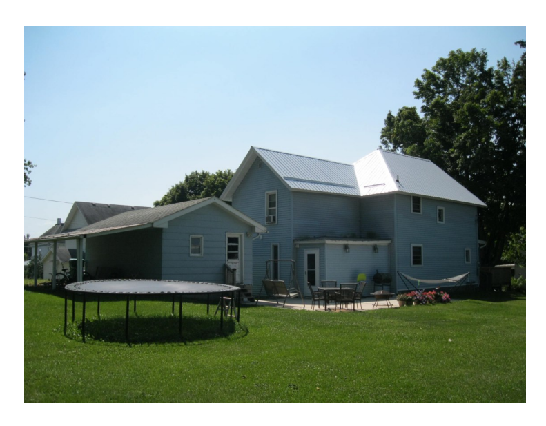
Information herein is believed to be accurate, but is not warranted. We assume no liability for errors.